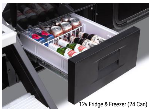
12v Fridge & Freezer (24 Can)