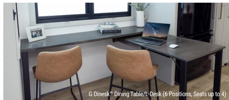
G Dinesk™ Dining Table/L-Desk (6 Positions, Seats up to 4)