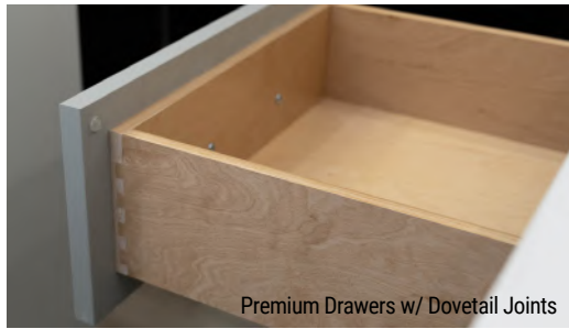
Premium Drawers w/ Dovetail Joints