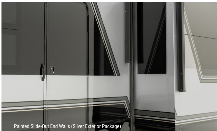
Painted Slide-Out End Walls (Silver Exterior Package)