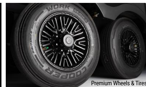
Premium Wheels & Tires