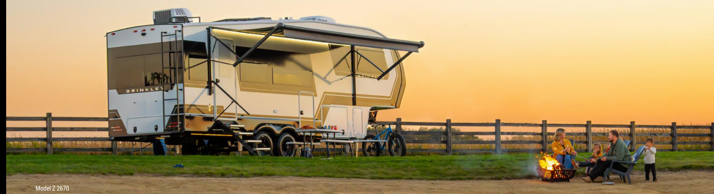
Model Z 2670

Everyone talks about quality, but it is incredibly disappointing what most of our industry is delivering. We are dedicated to producing the highest quality RVs. It begins with intelligent designs and a steadfast commitment to quality throughout the organization. However, it takes robust checkpoints to confirm that we deliver on our promise. In addition to production line checkpoint inspections, each and every Brinkley undergoes a vigorous off-road simulation and a battery of testing through our PDI process, covering over 500 items before your RV ships to the dealer. We have committed a tremendous amount of time and effort on the front end to KEEP YOU CAMPING AND OUT OF THE SERVICE SHOP!