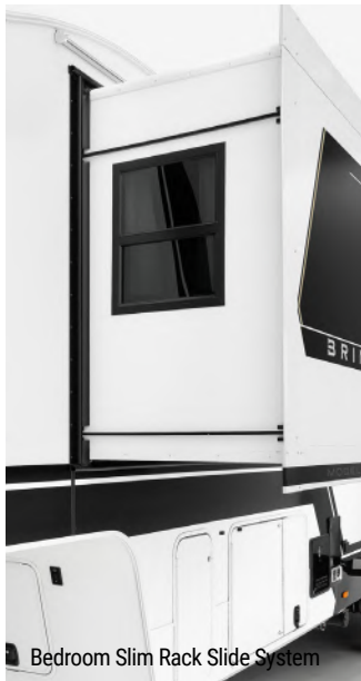
Bedroom Slim Rack Slide System