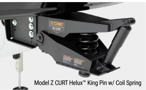
Model Z CURT Helux™ King Pin w/ Coil Spring