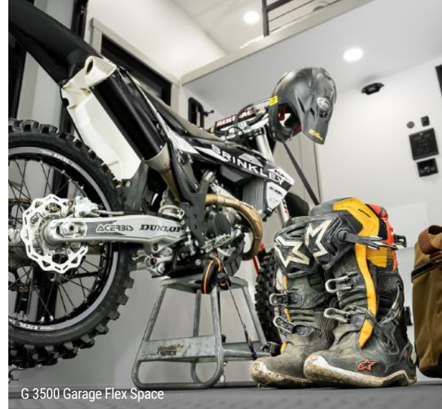
G 3500 Garage Flex Space