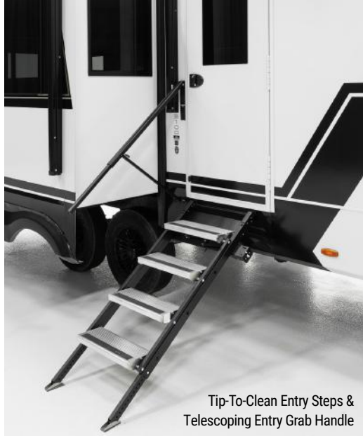
Tip-To-Clean Entry Steps & Telescoping Entry Grab Handle