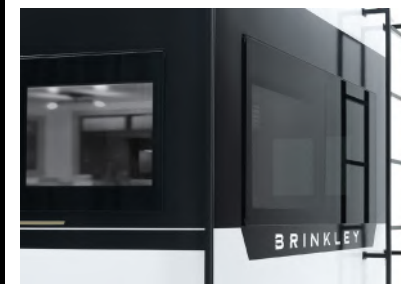
Square Euro Frameless Windows