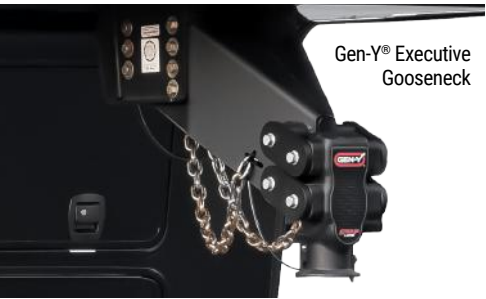
Gen-Y® Executive Gooseneck