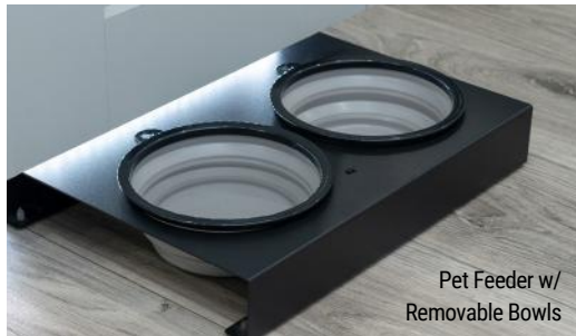
Pet Feeder w/ Removable Bowls