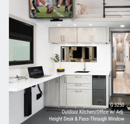
G 3250 Outdoor Kitchen/Office w/ Adj. Height Desk & Pass-Through Window

** Optional equipment & props may be shown. All content is subject to change without notice. Please consult with your dealer for current information.