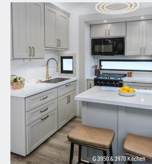
G 3950 & 3970 Kitchen