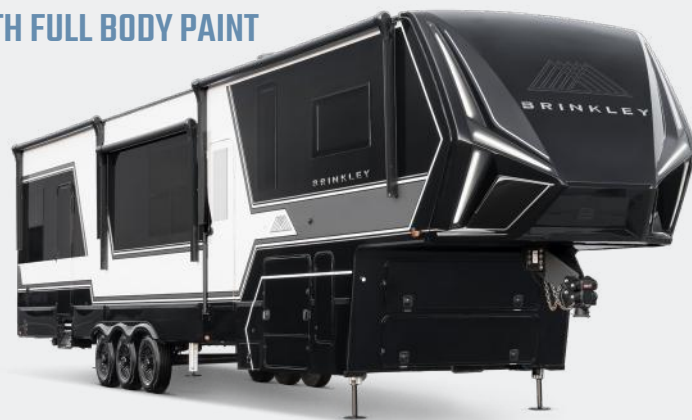
White & Black Premium Exterior Package