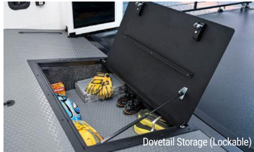
Dovetail Storage (Lockable)