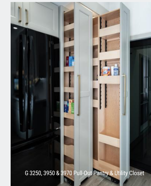
G 3250, 3950 & 3970 Pull-Out Pantry & Utility Closet