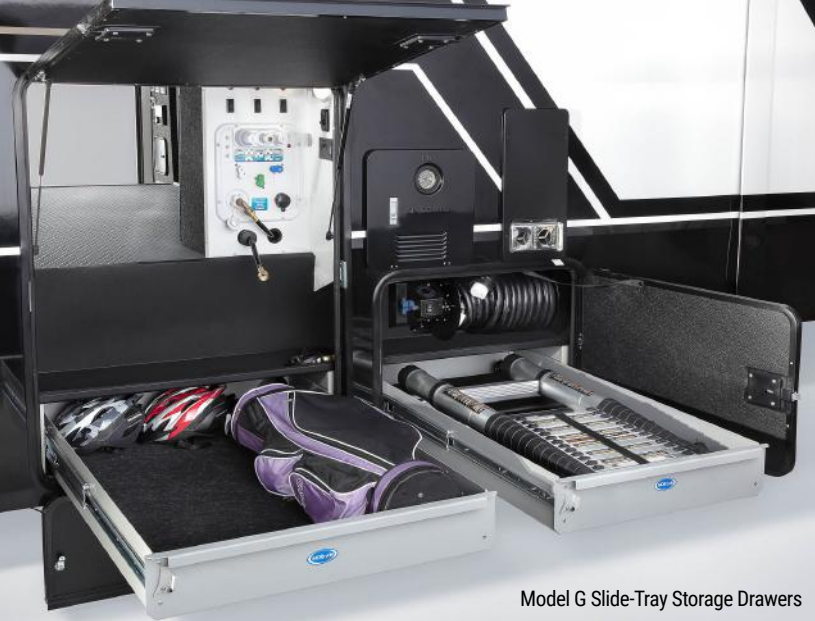
Model G Slide-Tray Storage Drawers