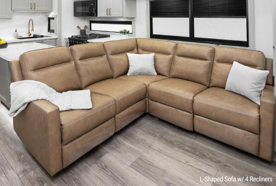
L-Shaped Sofa w/ 4 Recliners