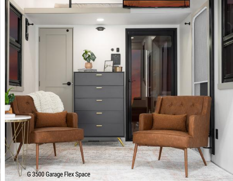
G 3500 Garage Flex Space