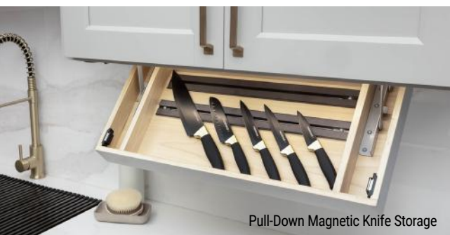
Pull-Down Magnetic Knife Storage