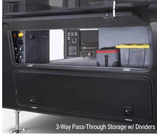
3-Way Pass-Through Storage w/ Dividers