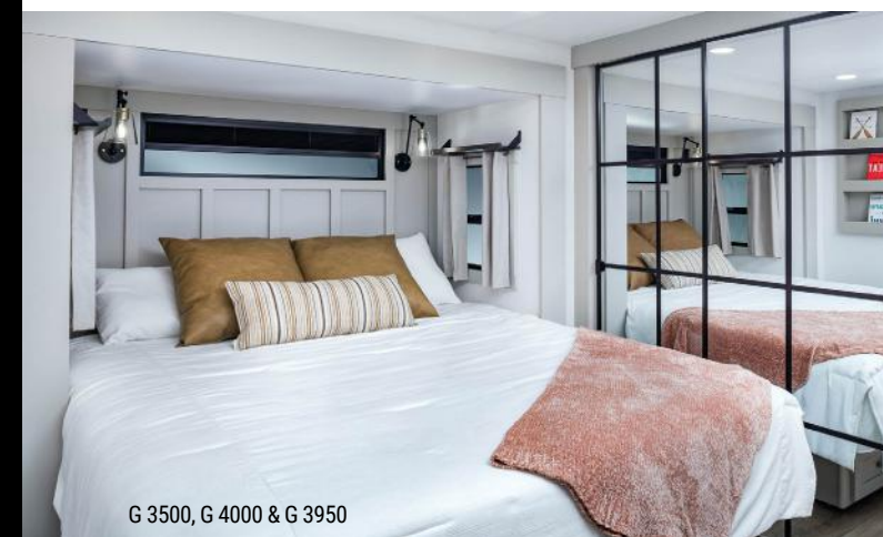
G 3500, G 4000 & G 3950